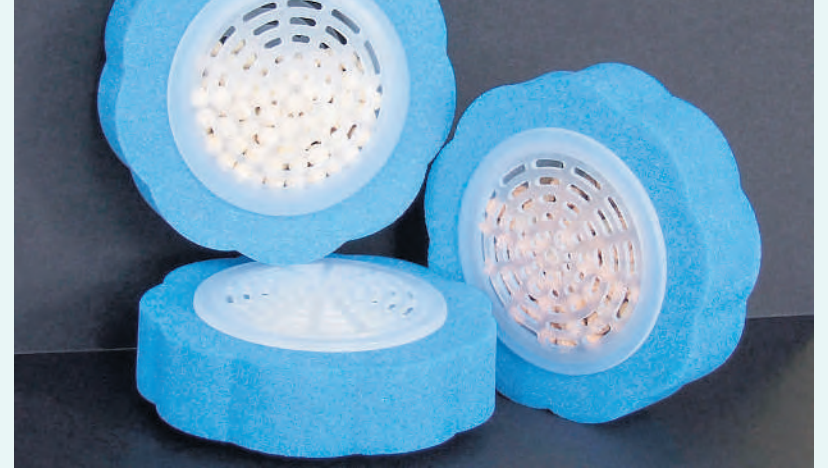
SMART: EnviroDisc reduces the cost of your wash and is environmentally friendly.